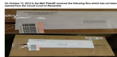
On October 13, 2012 in the Mail Plaintiff received the following Box which has not been opened from the Circuit Court of Alexandria