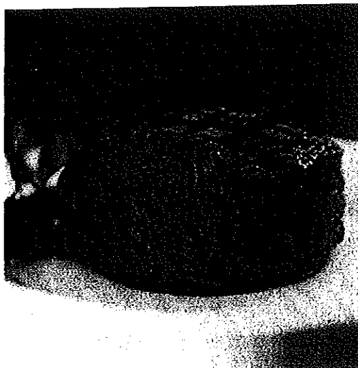
Double Cut Filet

Chicken Christopher Chicken Bianco Honey-Chili Glazed Salmon Fillet Braised Beef Short Rib Shrimp Scampi Capellini Braised Beef Short Rib & Jumbo Sea Scallop "Surf and Turf" Shrimp Alexander Jumbo Lump Crab Cakes Baked Stuffed Jumbo Shrimp Chilean Seabass Fillet a La Nage Cold Water Lobster Tail Alaskan King Crab Legs Whole Baked Maine Lobsters