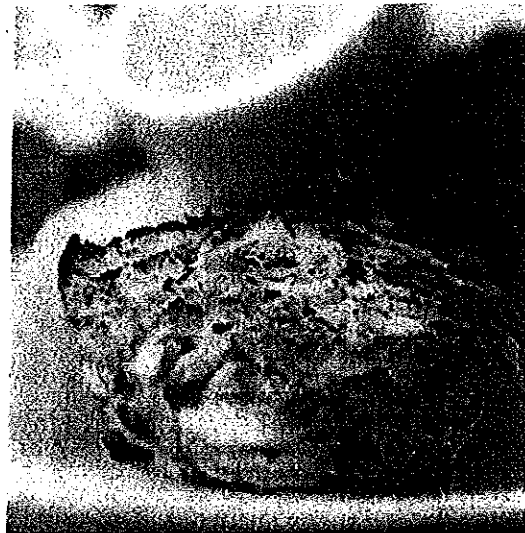
Jumbo Lump Crab Cake